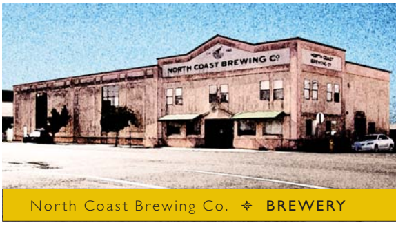
View of Brewery from intersection of Pine & Main Streets, looking southwest

Open 7 days a week from 10:00 am to 5:00 pm (When Brewery Shop is closed, visit our store in the Brewery Taproom)