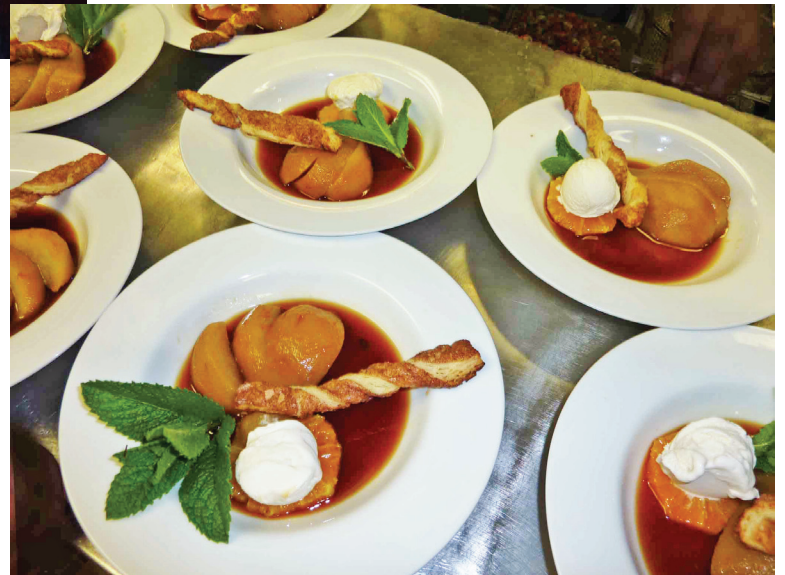
Old Stock-poached pears with Cinnamon twists, paired with North Coast Brewing Old Stock Ale

All proceeds benefit the Mendocino Music Festival www.mendocinomusic.com